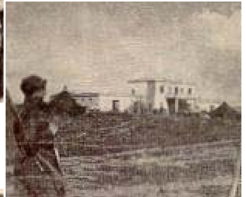
Italian Guard Duty—Feb. 1943