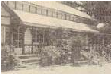
Villaggio Mancuso Rest Camp