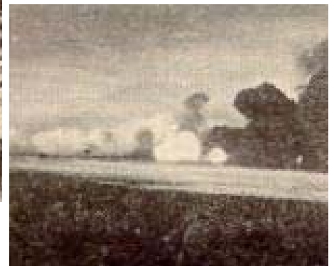
Bomb Dump Fire—1943