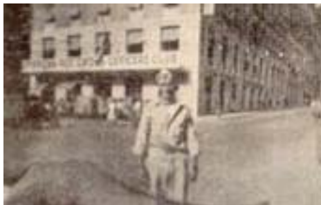
Rome ARC Officers Club