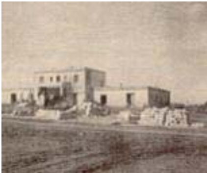
Start of Bath House