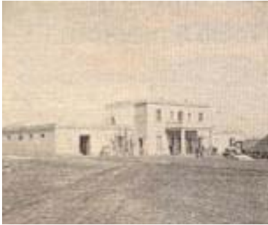
Hdqrs 764th "Santa Clotilde"