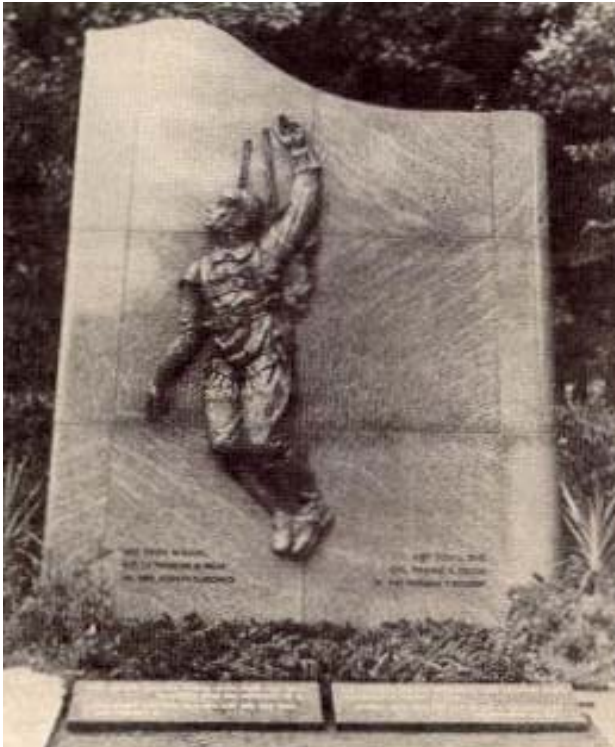
Monument to fallen comrades at Troubky, Czechoslovakia The inscription is written in both English and Czechoslovakia

kia, and have a (black Italian) marble monument with a bronze plaque, donated by the villagers of Troubky, to commemorate the day these American boys gave their lives so that Czechoslovakia could be free.