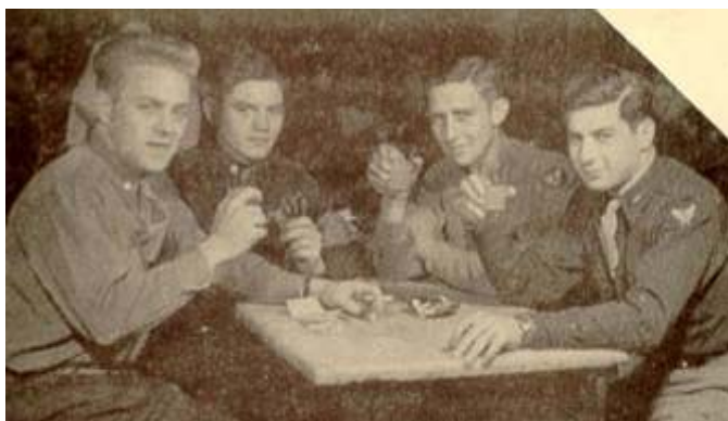
R & R in Rome