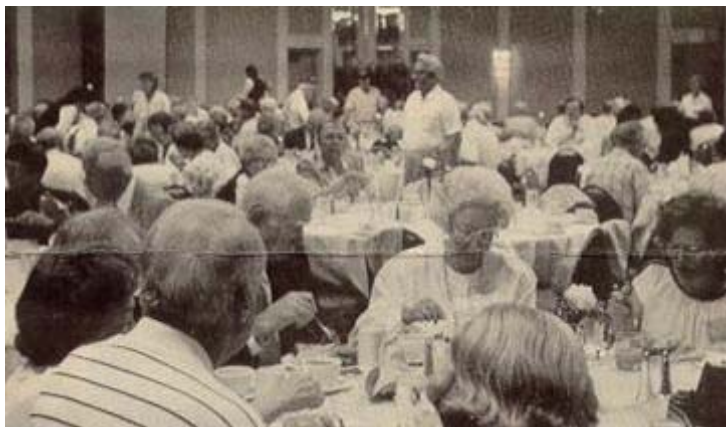
Sunday Breakfast—Doubletree Hotel