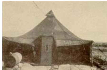
HOME SWEET HOME ITALY 1944