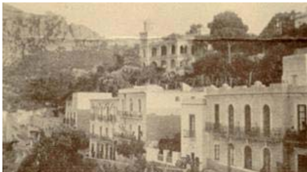
ISLE OF CAPRI—1444