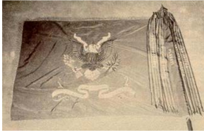
THE GROUP COLORS PRESENTED AT REUNION 1990 TUCSON, AZ