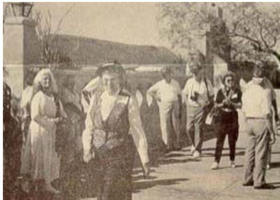
Touring San Xavier Mission