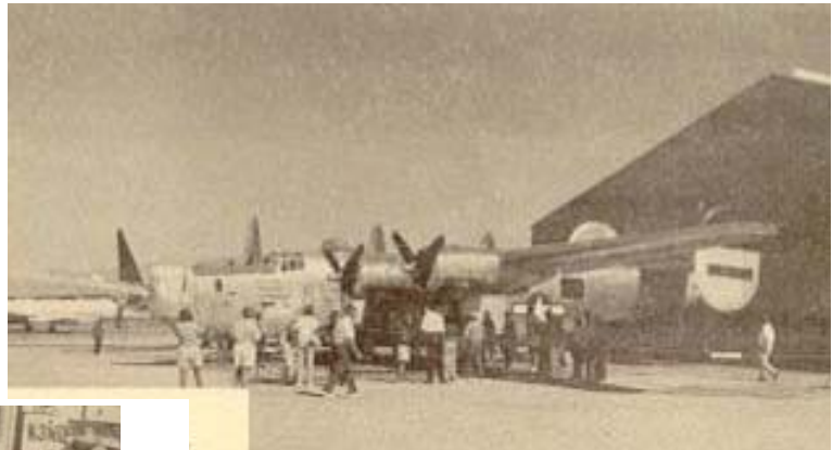
B-24J "Shoot, You're covered" Pima Air Museum, Tucson, AZ