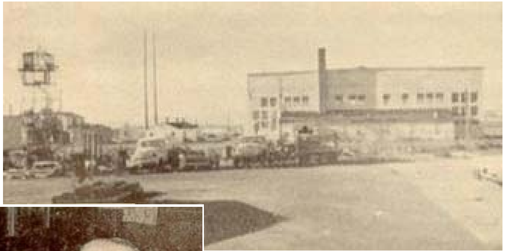
Wendover, Utah, revisited July, 1989