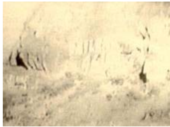
44 YEARS AGO—WHO